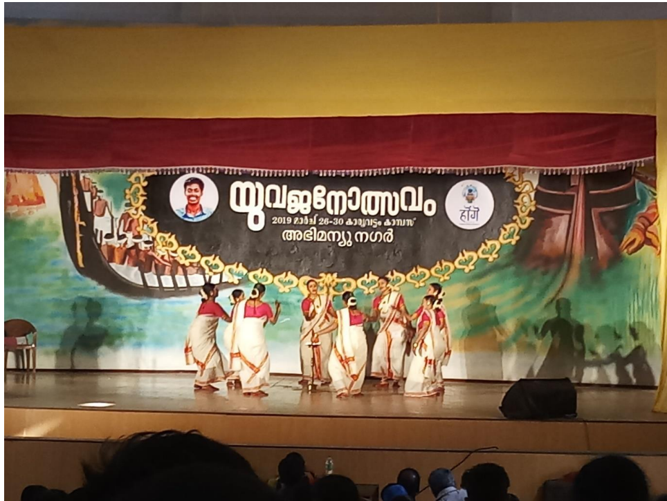
Thiruvathira Team on Stage