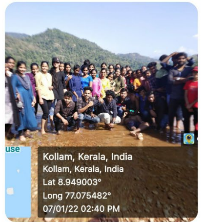
Kollam, Kerala, India Kollam, Kerala, India Lat 8.949003° Long 77.075482° 07/01/22 02:40 PM