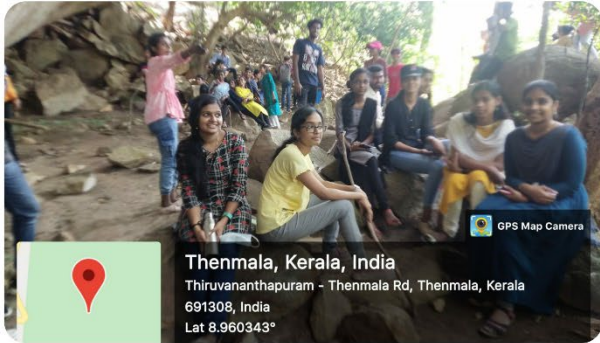
Thenmala, Kerala, India Thiruvananthapuram - Thenmala Rd, Thenmala, Kerala 691308, India Lat 8.960343°