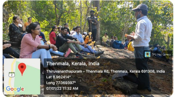
Thenmala, Kerala, India Thiruvananthapuram - Thenmala Rd, Thenmala, Kerala 691308, India Lat 8.962414° Long 77.069397° 07/01/22 11:32 AM