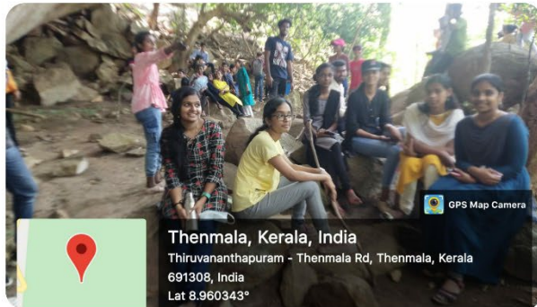
Thenmala, Kerala, India Thiruvananthapuram - Thenmala Rd, Thenmala, Kerala 691308, India Lat 8.960343°