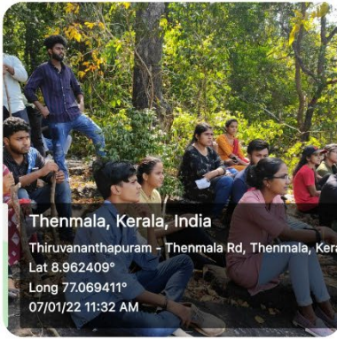
Thenmala, Kerala, India Thiruvananthapuram - Thenmala Rd, Thenmala, Kerala Lat 8.962409° Long 77.069411° 07/01/22 11:32 AM