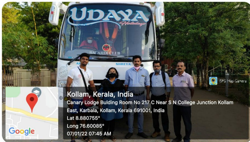
Kollam, Kerala, India Canary Lodge Bulding Room No 217 C Near S N College Junction Kollam East, Karbala, Kollam, Kerala 691001, India Lat 8.880755° Long 76.60085° 07/01/22 07:45 AM