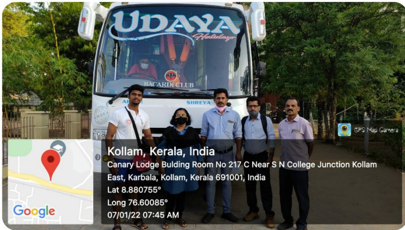
Kollam, Kerala, India Canary Lodge Bulding Room No 217 C Near S N College Junction Kollam East, Karbala, Kollam, Kerala 691001, India Lat 8.880755° Long 76.60085° 07/01/22 07:45 AM