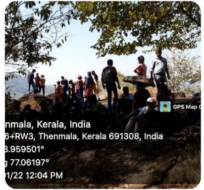
Thenmala, Kerala, India 6+RW3, Thenmala, Kerala 691308, India Lat 8.959501° Long 77.06197° 07/01/22 12:04 PM