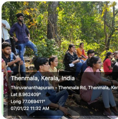
Thenmala, Kerala, India Thiruvananthapuram - Thenmala Rd, Thenmala, Kera Lat 8.962409° Long 77.069411° 07/01/22 11:32 AM