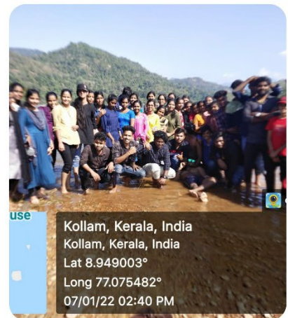
Kollam, Kerala, India Kollam, Kerala, India Lat 8.949003° Long 77.075482° 07/01/22 02:40 PM