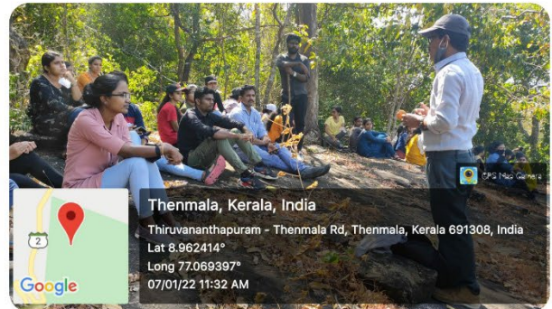
Thenmala, Kerala, India Thiruvananthapuram - Thenmala Rd, Thenmala, Kerala 691308, India Lat 8.962414° Long 77.069397° 07/01/22 11:32 AM