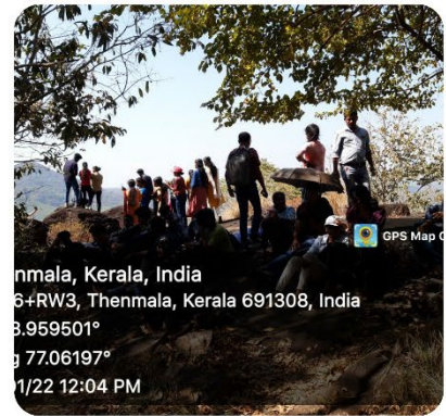
Thenmala, Kerala, India 6+RW3, Thenmala, Kerala 691308, India 8.959501° g 77.06197° 1/22 12:04 PM