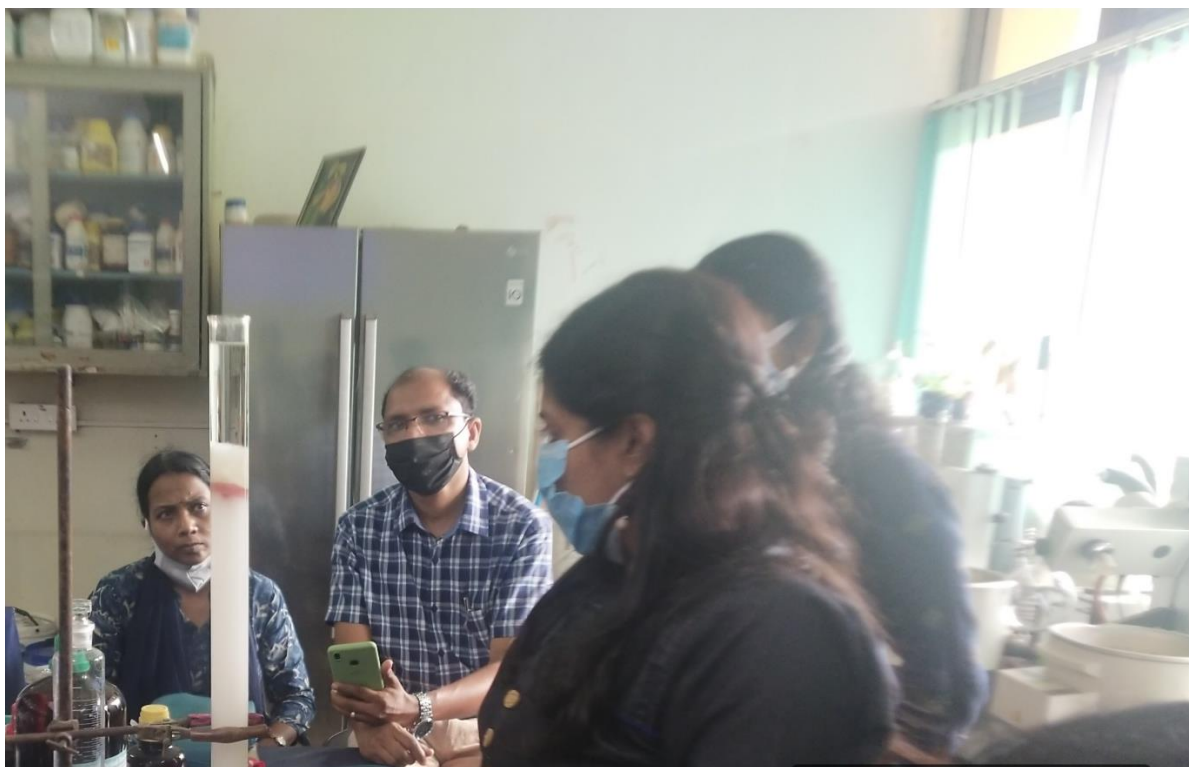
AN INTER-DEPARTMENTAL TRAINING PROGRAM ON PHYTOCHEMISTRY ORGANIZED FOR FACULTIES OF THE DEPARTMENT OF BOTANY, SREE NARAYANA COLLEGE, KOLLAM AND THE DEPARTMENT OF BOTANY, MAHATMA GANDHI COLLEGE, THIRUVANANTHAPURAM.