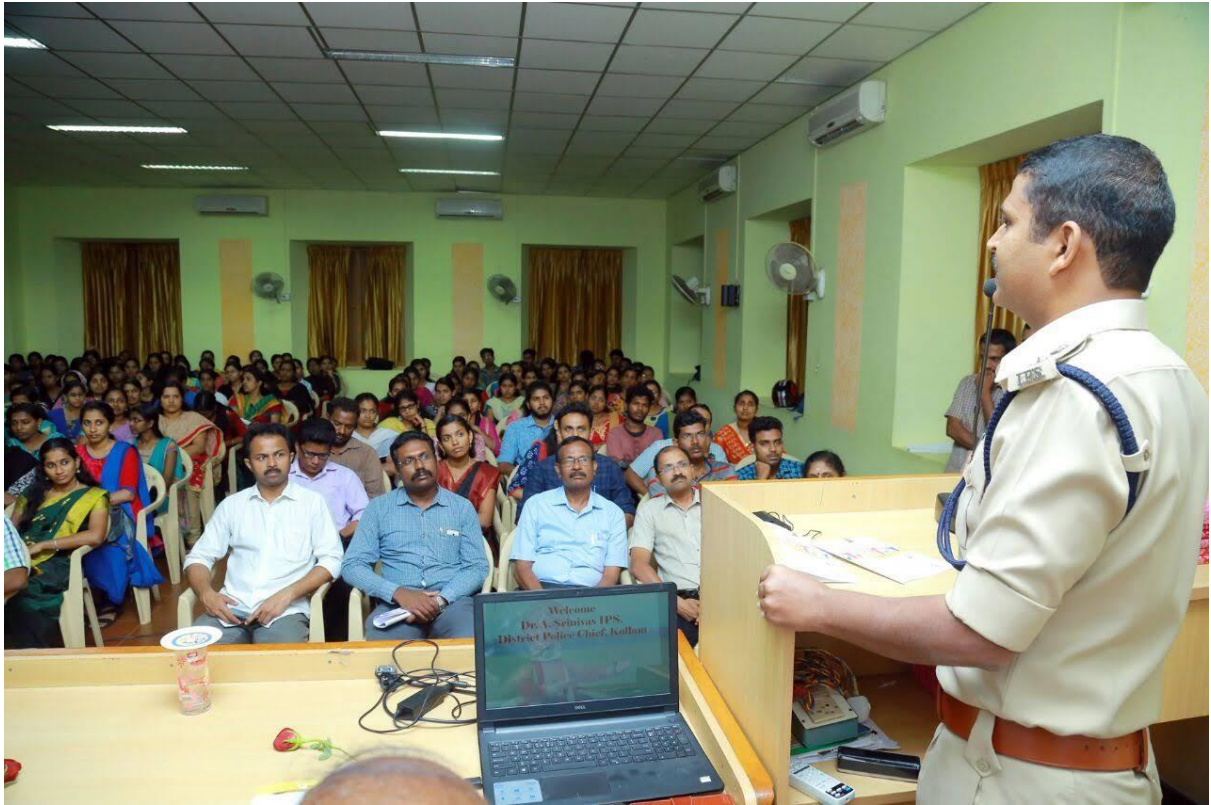
Enthusiastic audience hang on the words of Chief guest